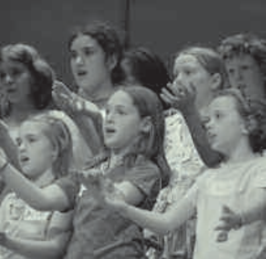
The Minneapolis Youth Chorus was one of six participating choral ensembles for a Minnesota Voices premiere at the Minnesota State Fair.

The American Composers Forum enriches lives by nurturing the creative spirit of composers and communities. We provide new opportunities for composers and their music to flourish, and engage communities in the creation, performance, and enjoyment of new music.