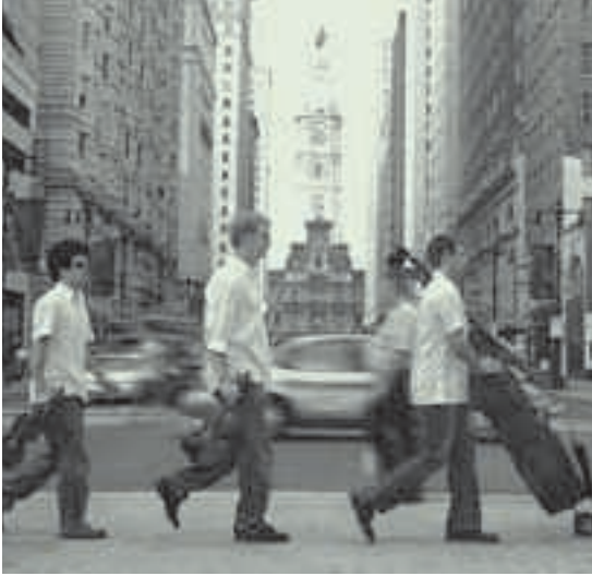
ACF members in Philadelphia heard the ensemble Time for Three (pictured above) rehearse a new work by Jennifer Higdon during a Composer-to-Composer session with the composer and the Philadelphia Orchestra.

The American Composers Forum enriches lives by nurturing the creative spirit of composers and communities. We provide new opportunities for composers and their music to flourish, and engage communities in the creation, performance, and enjoyment of new music.