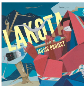
South Dakota Symphony Orchestra Lakota Music Project