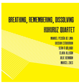
Kukuruz Quartet Breathing, Remembering, Dissolving